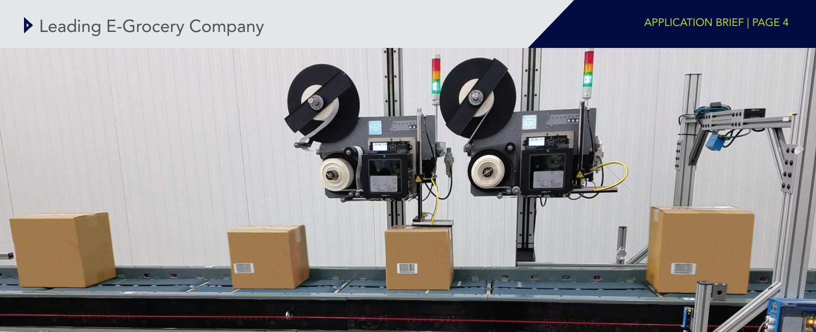
Print & Apply Labeling